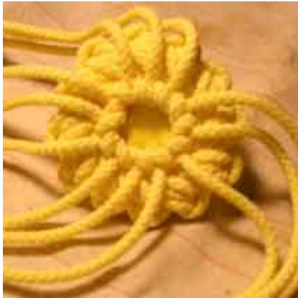
First Crown completed