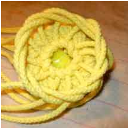
Now do a complex (over 2) crown sennit